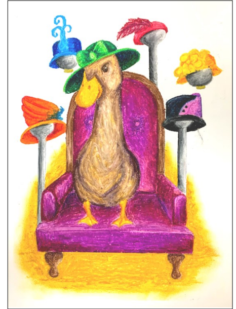
Artwork Example: I Like to Wear Her Hats

*Please note that this is just an example of the lesson. Students should always be encouraged to create and complete their own artwork.